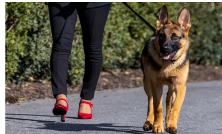
Commander, Biden's dog

The Biden family's dog, Commander, had to leave the White House because he kept biting people, including a Secret Service agent. They are not sure where he will live next. This happened 11 times, and some reports say there were more incidents. Another Biden dog, Major, had similar issues last year and was sent to live with friends.