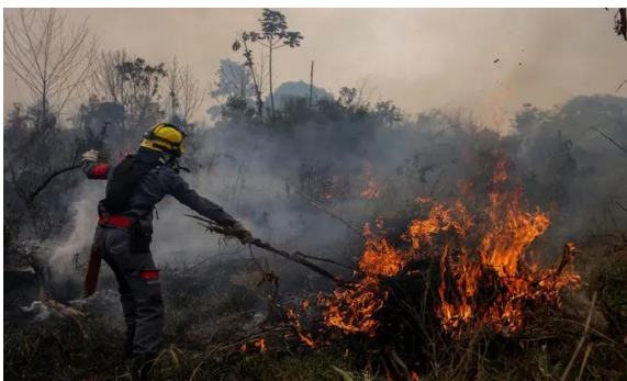
Picture of a blaze in Amazon rainforest in Brazil