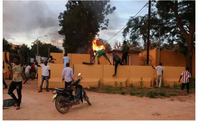
Protesters attacked the French embassy in Burkina Faso on Saturday