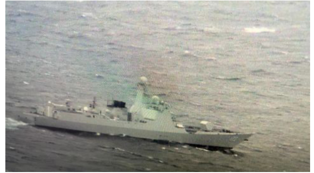
A picture of the Chinese People's Liberation Army Navy destroyer Changsha as seen on the computer screens of a US Navy P-8A reconnaissance jet over the South China Sea on Friday.